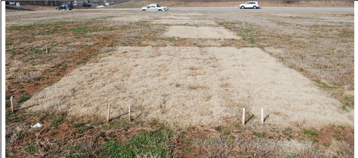
Fall 2021 companion crop planting in Yadkin county on 15 February 2023 – 16 months (64 weeks) after planting.

received an additional summer (July) planting in 2021 that was not repeated in year two. This study was arranged in a randomized complete block design with whole plots measuring 6.1 m × 1.5 m with three replications. The study area received no supplemental irrigation beyond natural rainfall.