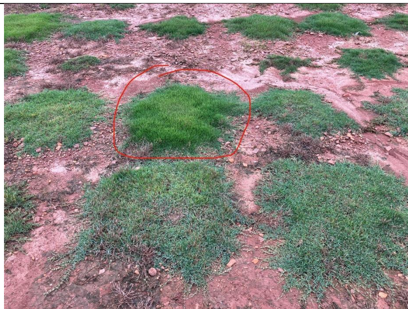
Nursery plots at the Turf Field Lab (Raleigh, NC) showing distinct differences in establishment rates among entries.

Means for establishment rates for 2021 and 2022 at all three locations for commercial checks and the top ten performing lines. Plots were evaluated on a scale of 1 to 5, where 1 = no lateral spread and 5 = complete plot coverage. Cells highlighted in pink represent values one standard deviation above the mean.